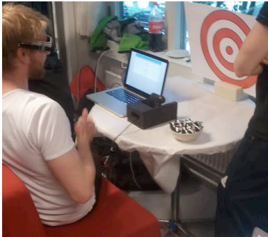
WiRe: Whiplash Rehabber uses a head-mounted laser and camera tracking to aid testing and rehabilitation of whiplash patients.