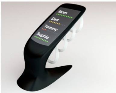
Virtual model of the BeChange hub used to recharge the personal wristbands. The central hub encourages the family to work together toward their fitness goals.